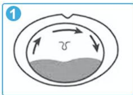
Clean the mouth