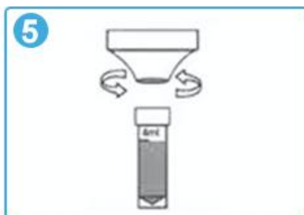
Unscrew the collection tube