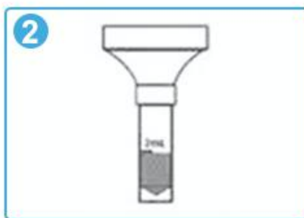
Spit saliva lightly